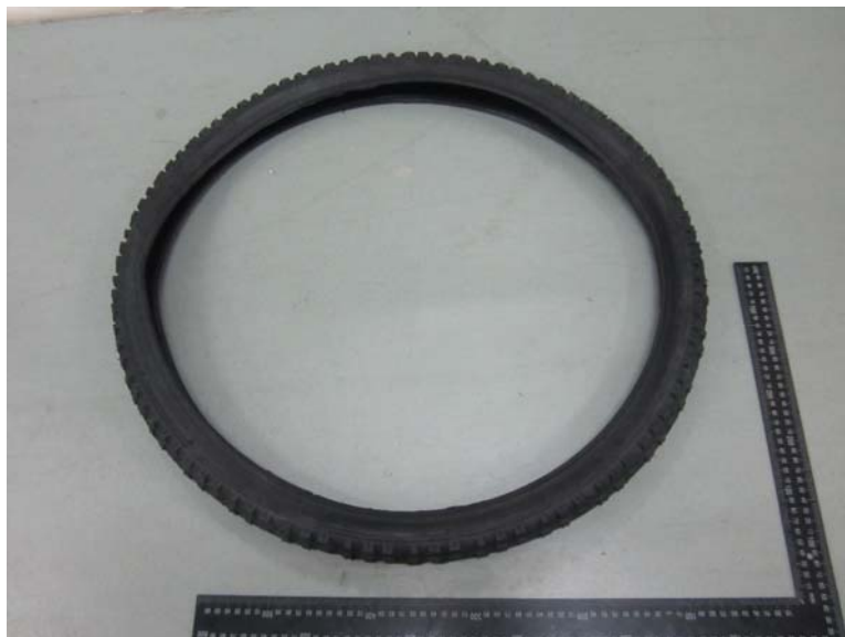
Photo of Sample